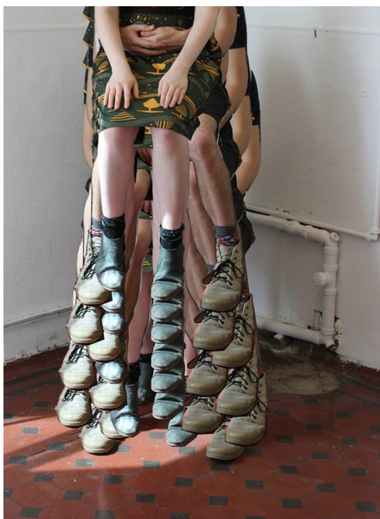
Sit. Support. Repeat. (Inkjet Print, 2016).