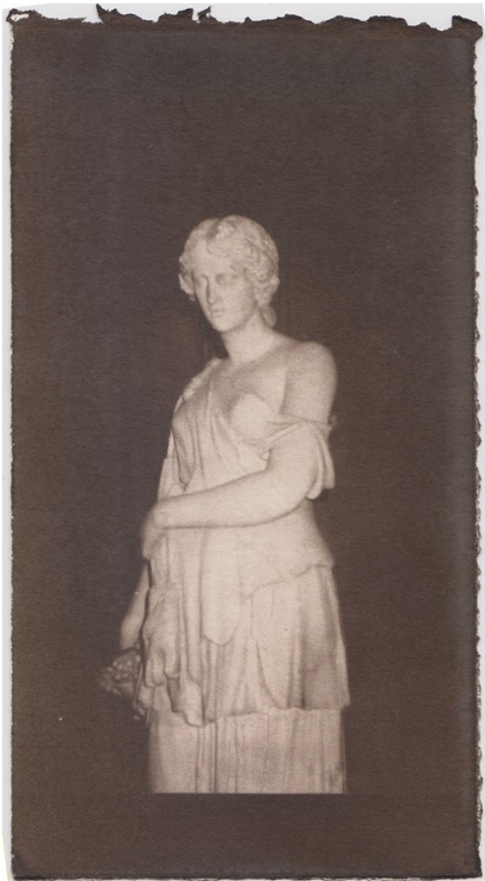
Self Holding (Van Dyke print, 2014).